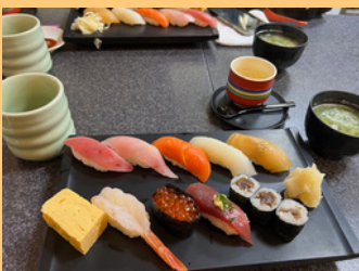
Nigiri sushi including ama ebi - sweet SHRIMP

Include beautiful sights along the way, your favourite shrimp dishes, karaoke and other 'Shrimply the best biker' moments. We'll feature our favourites each week on on our social media.