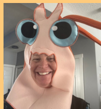
SHRIMPPLY THE BEST DRESSED.