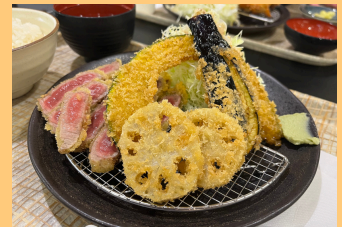
Tempura, breaded and deep fried vegetables and SHRIMP