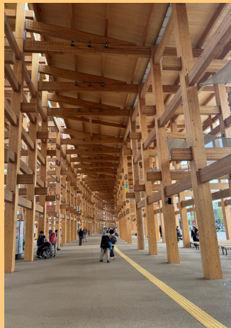
The giant wood ring