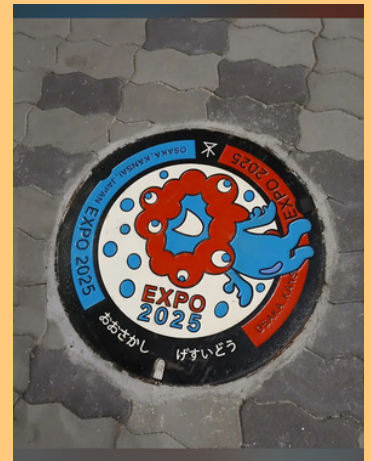
Myaku-Mayku Expo mascot