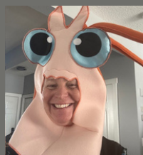
SHRIMPPLY THE BEST DRESSED.