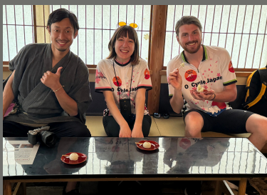
Shrimply the best tea

We'll feature our favourites each week on our social media.