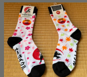
Shrimply the best socks!